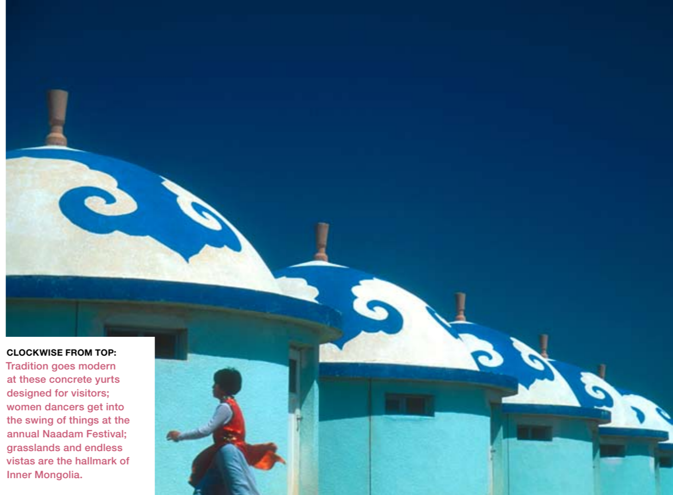
CLOCKWISE FROM TOP: Tradition goes modern at these concrete yurts designed for visitors; women dancers get into the swing of things at the annual Naadam Festival; grasslands and endless vistas are the hallmark of Inner Mongolia.

province is best known for its vast grasslands and deserts.