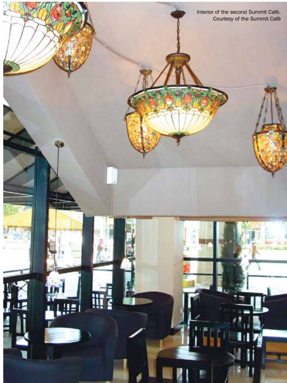
Interior of the second Summit Café.

For all its cultural richness, spectacular scenery and recent economic development, the Tibetan capital Lhasa isn't the greatest of hangouts for globetrotting gourmands. In years gone by, the best alternative to local brews that caffeine-craving travelers could expect was a sachet of instant Nescafé.