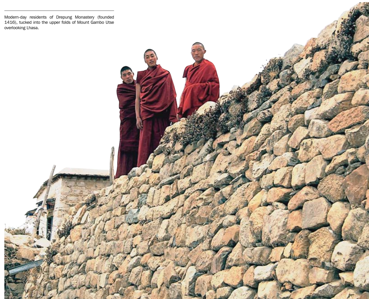
Modern-day residents of Drepung Monastery (founded 1416), tucked into the upper folds of Mount Gambo Utse overlooking Lhasa.

And to the volumes already written about that remarkable structure of nature... what could I possibly add? ■