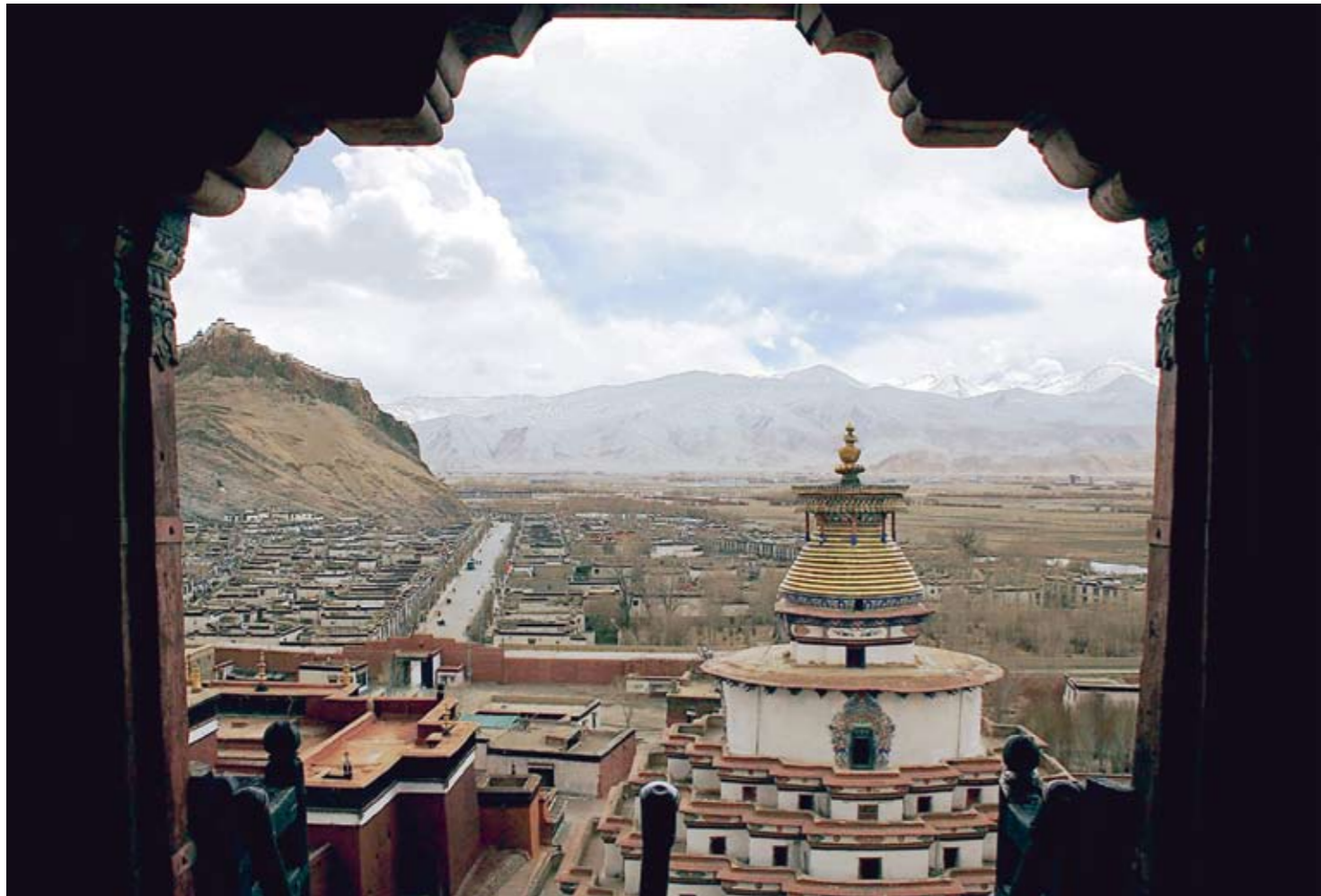
Presiding over the remote mountain town of Gyantse, Pelkor Choede Monastery, in operation since 1440.