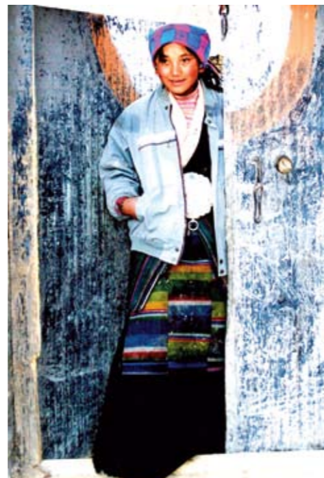
In the Tibetan hinterlands, about 600 kilometers from Lhasa, in a rustic and very remote village, appears a young woman of grace and beauty.

Tucked into the upper folds of Mount Gambo Utse and spanning 250,000 square